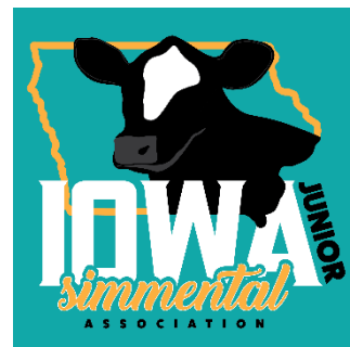
5th Overall Percentage Heifer shown by McKenna DeCap (No photo available)