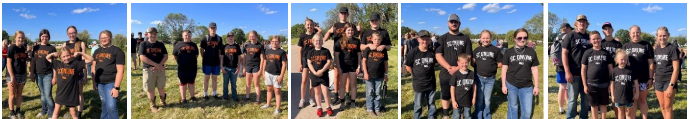
Iowa youth had 5 teams participate in the volleyball tournament!

Below are more fun photos from Opening Ceremonies, volleyball tournament, contests and more!