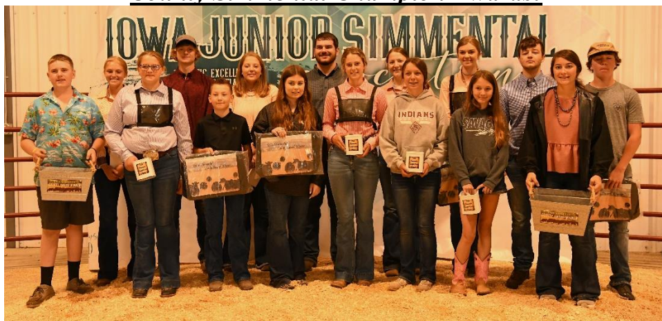
44 Juniors from 27 counties showed 48 Champion Simmental Animals at their 2021 County Fairs! Pictured above are the youth who picked up their award at Field Day. (All Champions will be listed on the ISA Website)