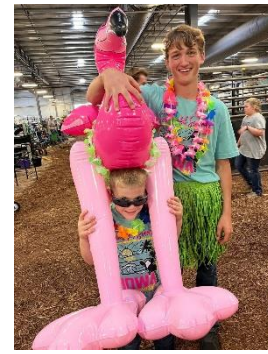
Summer-time fun props during Opening Ceremonies