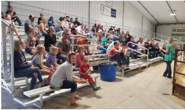
Junior Meeting (top) and AJSA Contest Preparation (below)