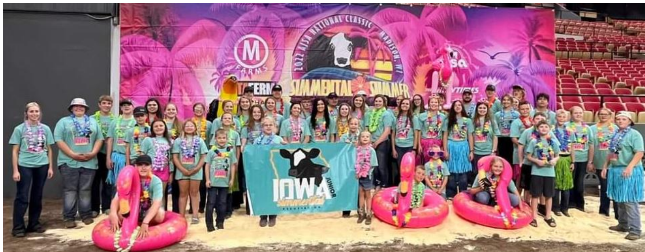
Iowa Juniors really got into the theme “Simmental Summer” for Opening Ceremonies (more photos below).