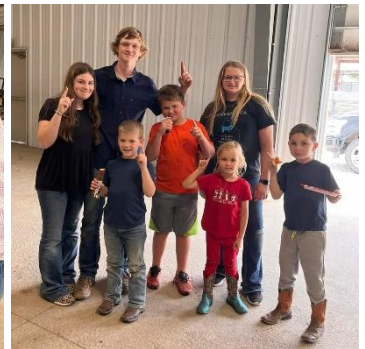
“Minute to Win it” games and making friends!

Congratulations to all the IJSA youth and their families at this year’s event!