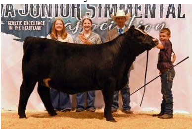
4th Overall & Reserve Bred & Owned Purebred Heifer shown by Creed Ruby